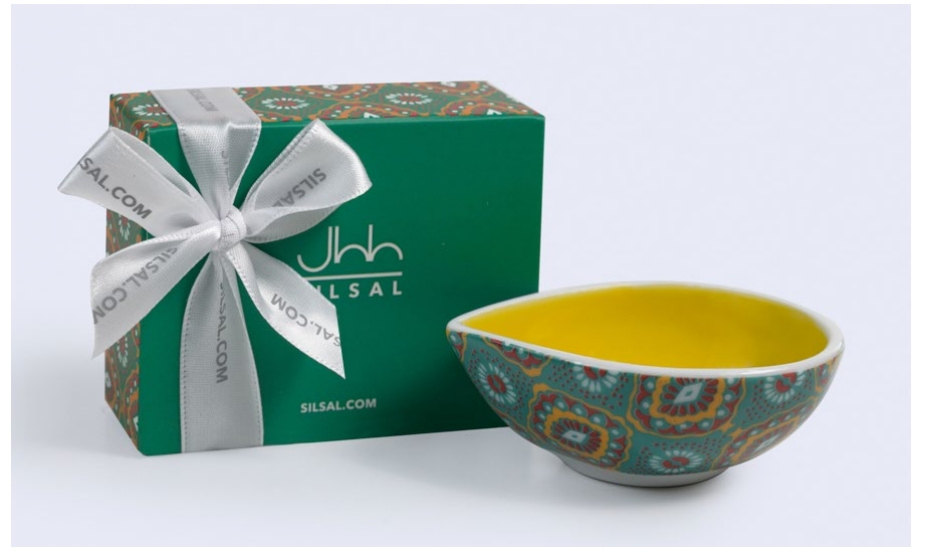
The Agra Diya AED 74

Meet The Luminara Rose Heritage Candle, created specifically for Diwali celebrations. Its captivating fragrance is designed to enhance the ambiance and create the perfect mood for this festive occasion.