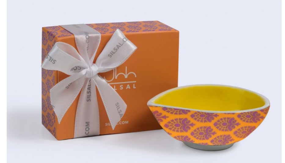
The Jaipur Diya AED 74