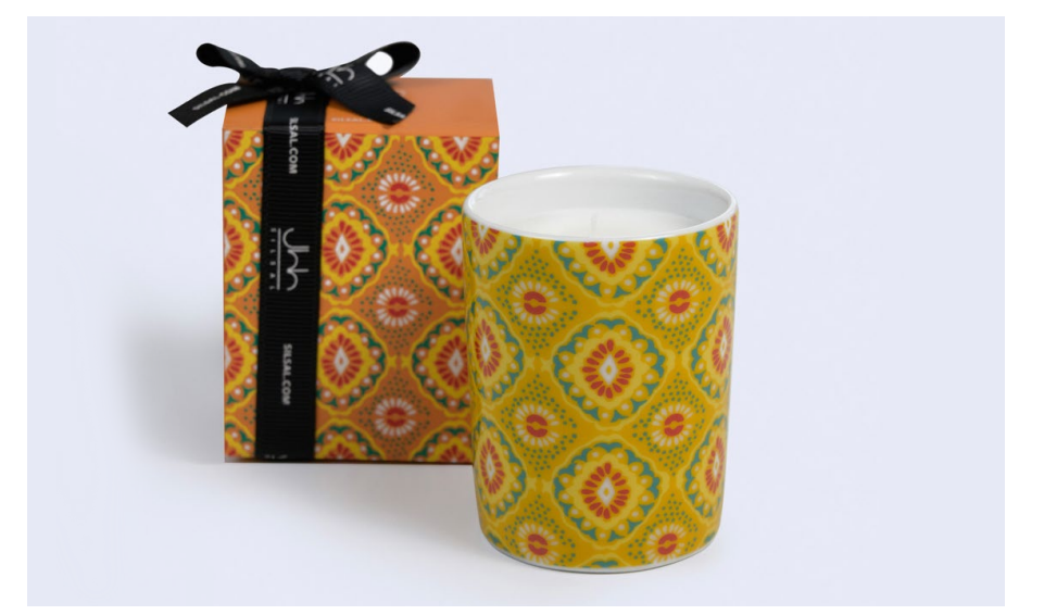
The Goa Candle - 60g AED 69