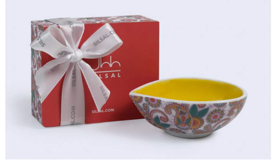
The Varanasi Diya AED 74