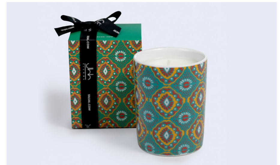
The Agra Candle - 60g AED 69