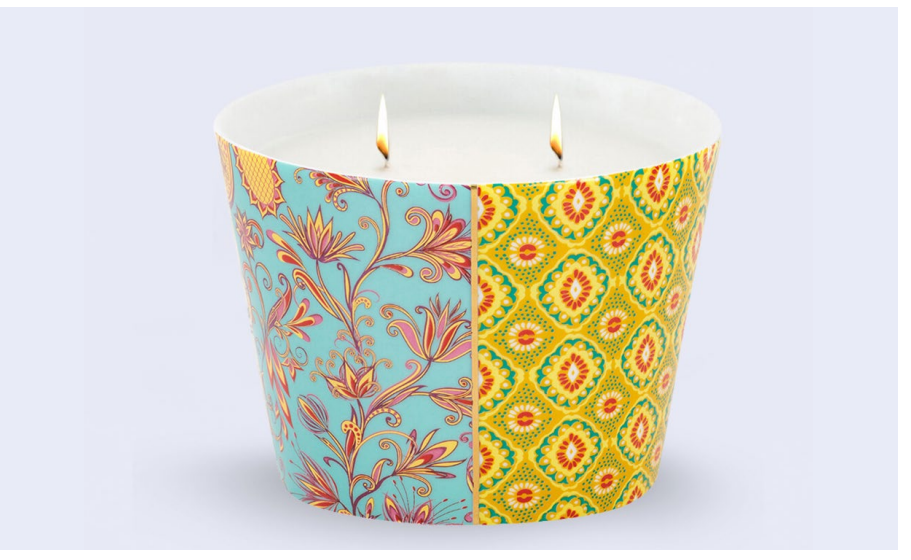
Luminara Rose Heritage AED 310