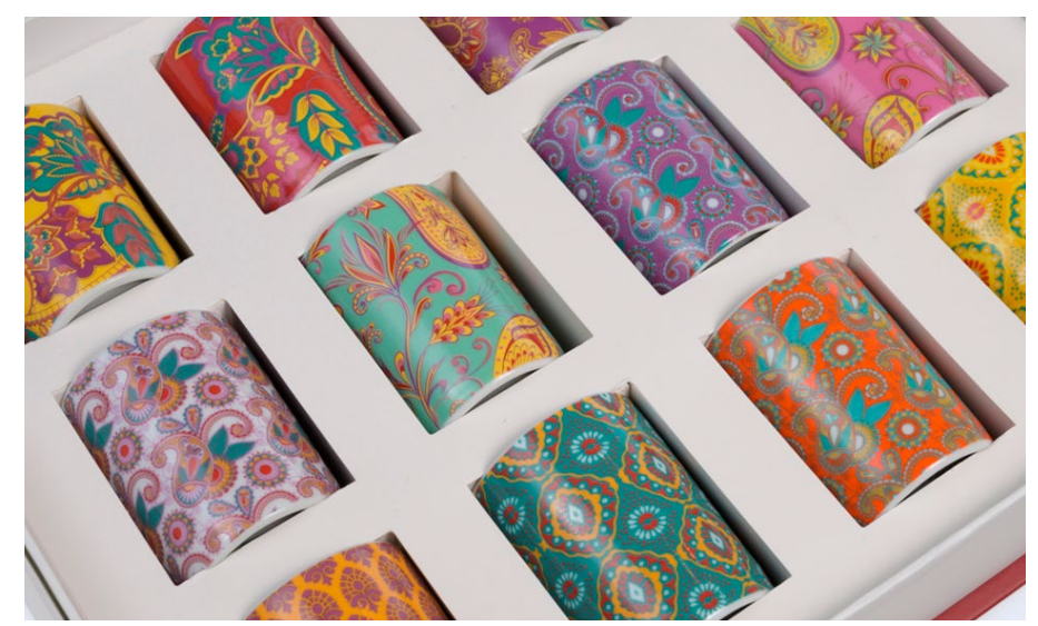
India Mix & Match 12 Mini Candles