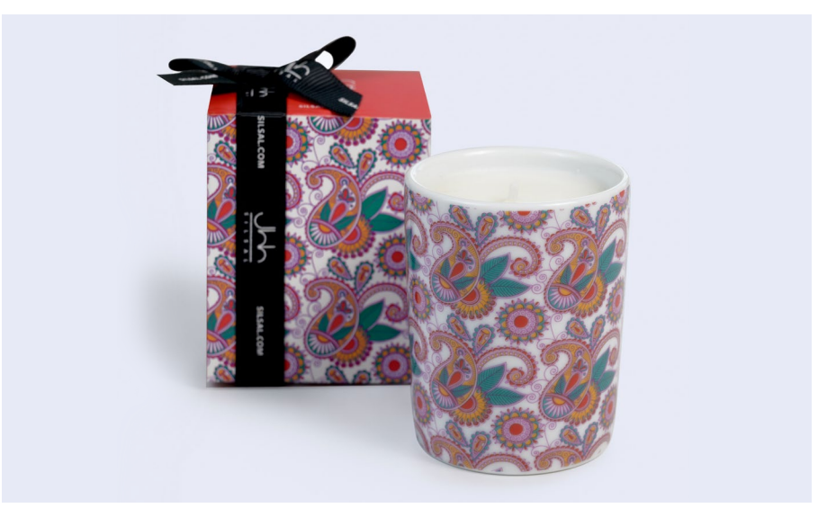
The Varanasi Candle - 60g AED 69