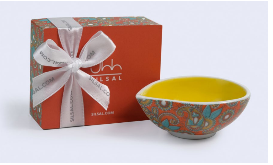
The Delhi Diya AED 74