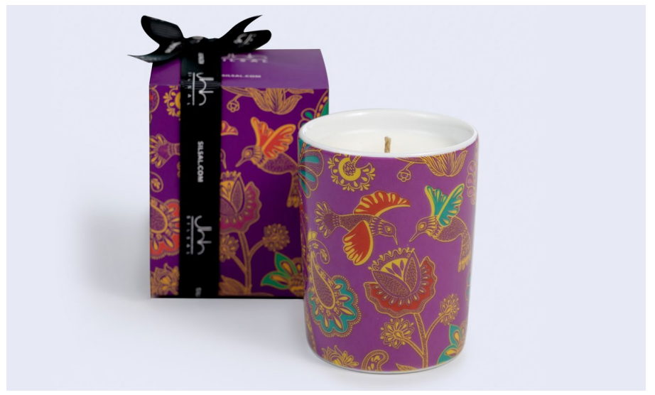
The Chennai Candle - 60g AED 69

These statement makers are the perfect addition to any home. Can't decide on a color? Flip through the catalog to explore mix and match options, as well as gift hamper options.