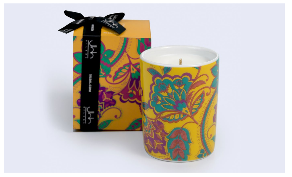
The Gaya Candle - 60g AED 69