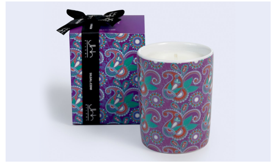
The Mumbai Candle - 60g AED 69