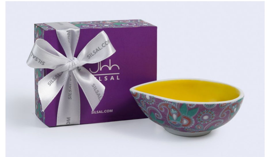
The Mumbai Diya AED 74