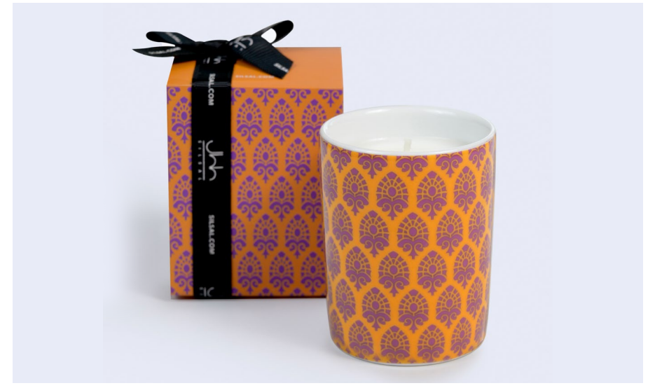
The Jaipur Candle - 60g AED 69