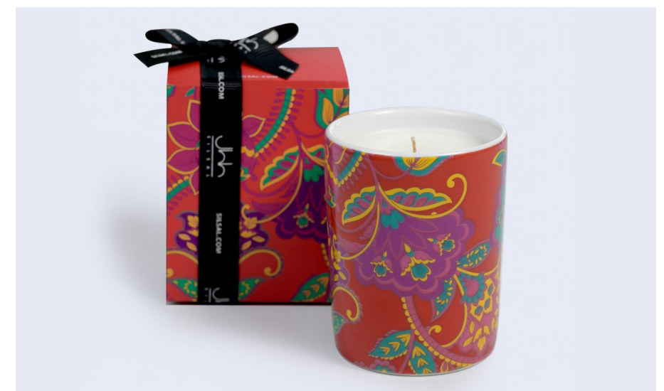
The Nashik Candle - 60g AED 69