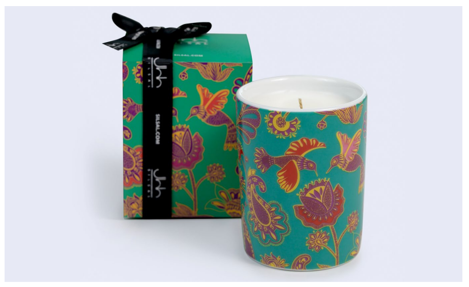
The Udaipur Candle - 60g AED 69

The Diwali 60g candles are beautifully presented in a gift box, making a unique corporate gift or felicitous present.