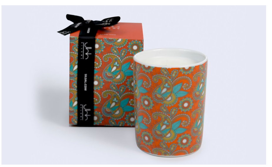
The Delhi Candle - 60g AED 69