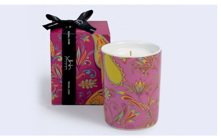
The Bhopal Candle - 60g AED 69